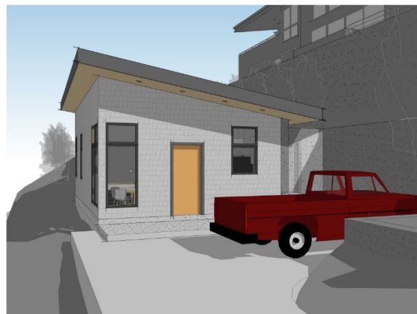
ADU ENTRANCE A5 AE104