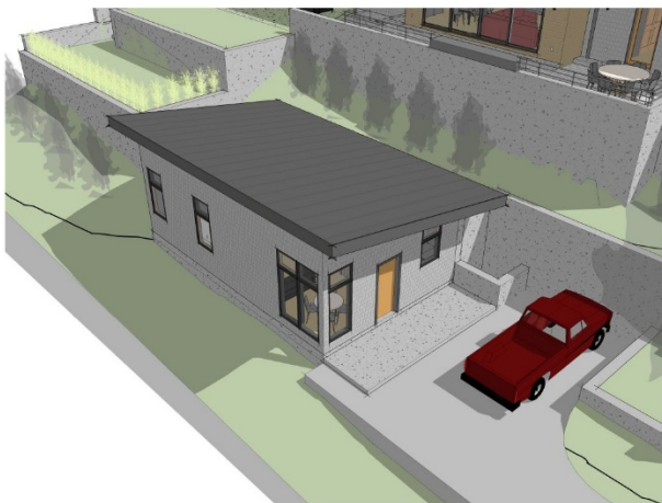
ADU OVERVIEW 1 A3 AE104